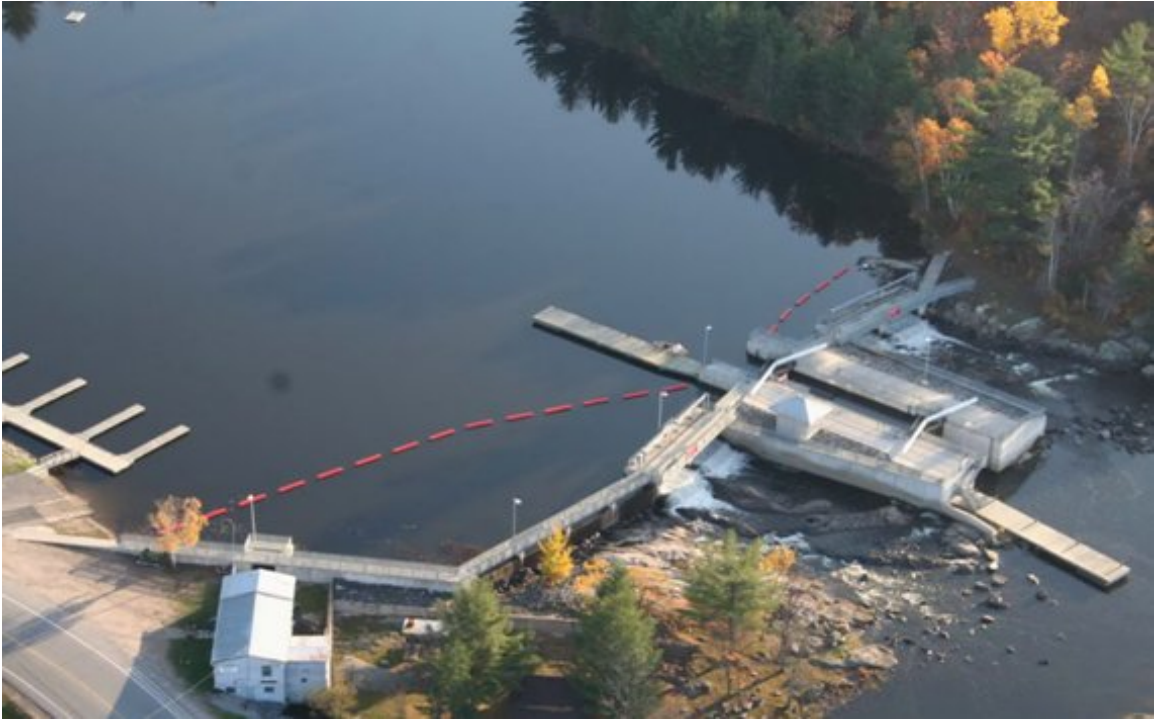
Aerial view of Magnetawen Lock from the Ontario Ministry of Natural Resources web site.