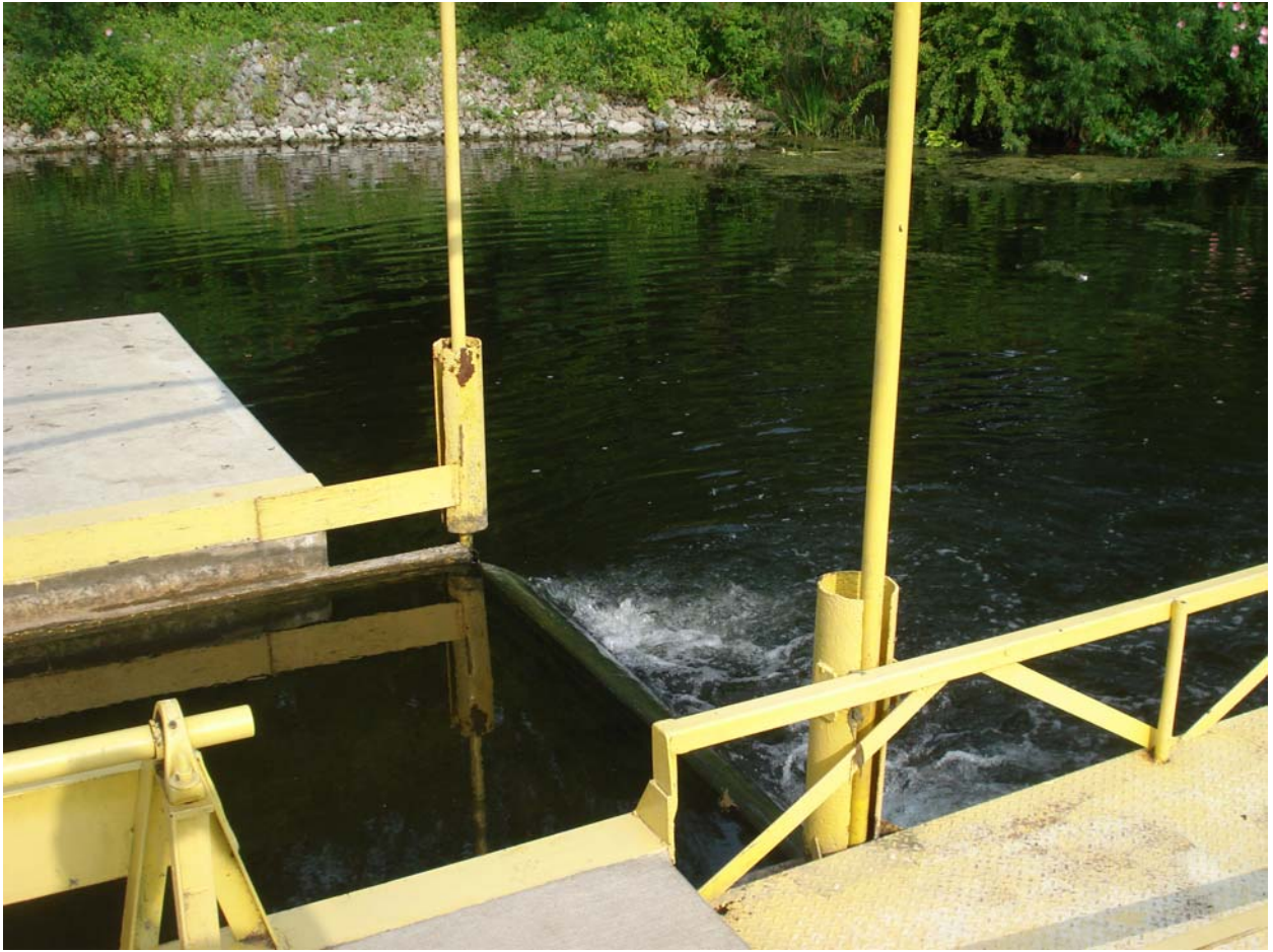
Close up of the lower gate, raised