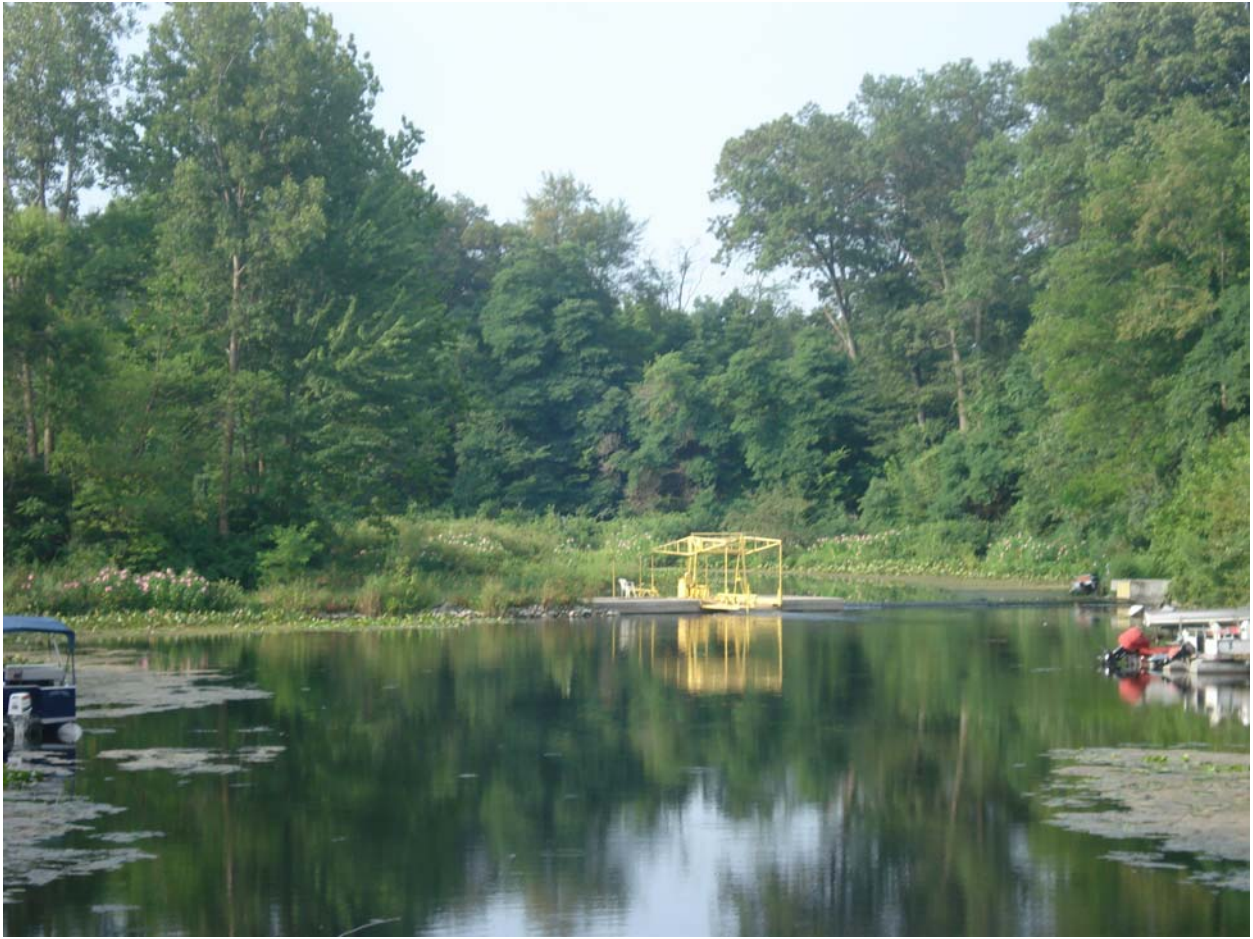
Barbee Lakes Boat Transfer Structure from the public access landing