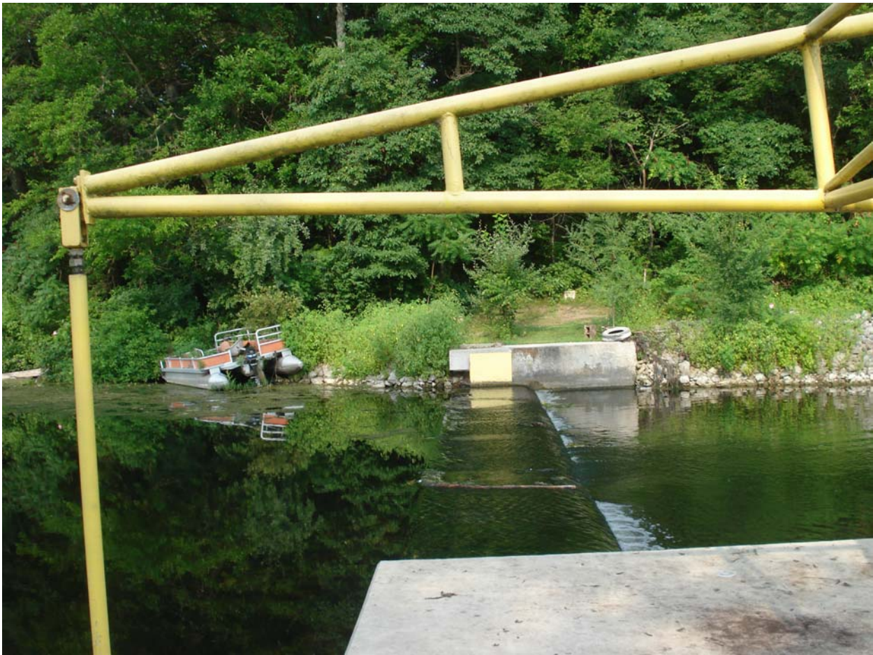
View across the dam