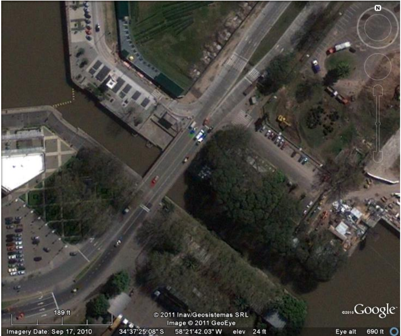
Buenos Aries Harbor South Lock