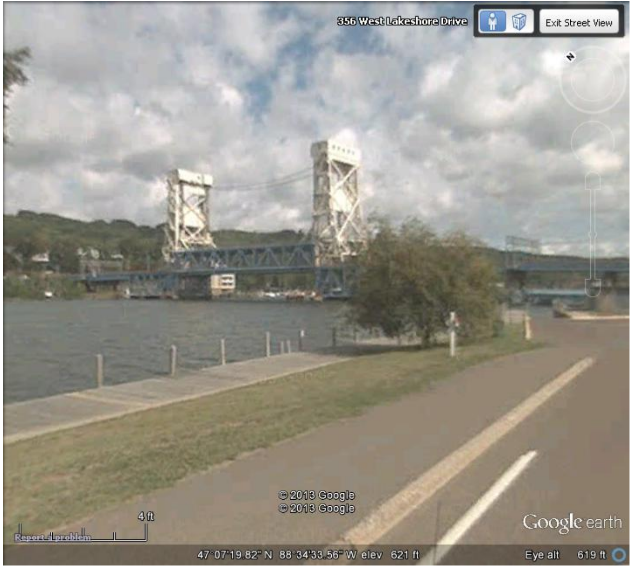
The only bridge over the Keweenaw Waterway