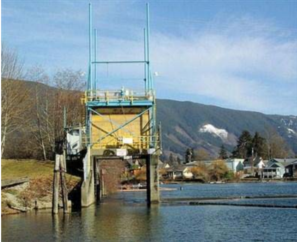
View through the lock with the gates open