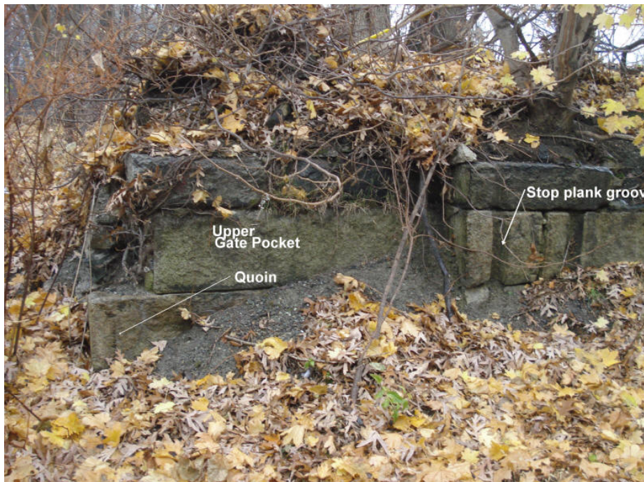
Blackstone Canal Just south of Mineral Springs Ave at remaining upper gate pocket of Lock 5 12/4/12