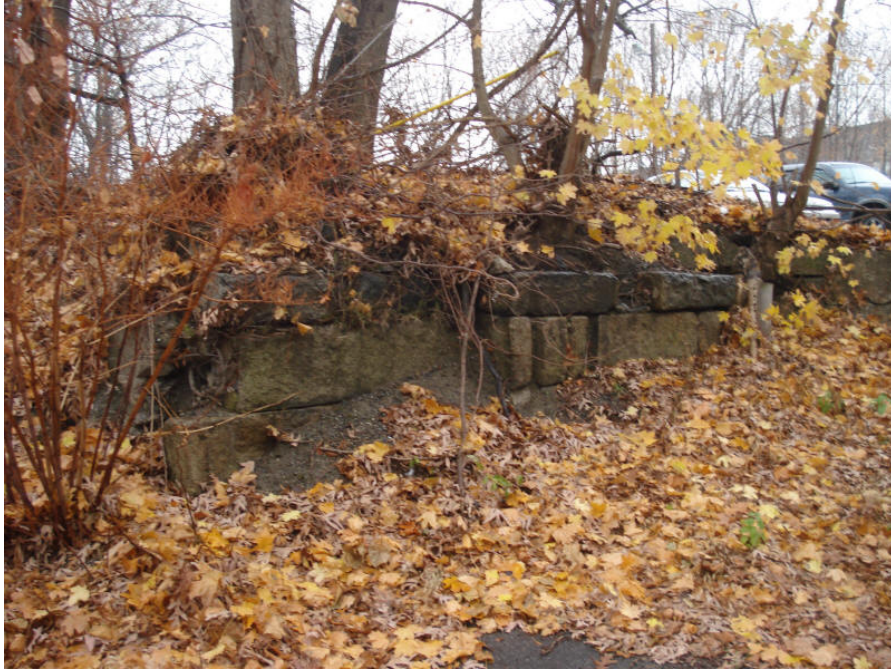
Blackstone Canal Remaining upper gate pocket of Lock 5 and approach wall to right 12/4/12