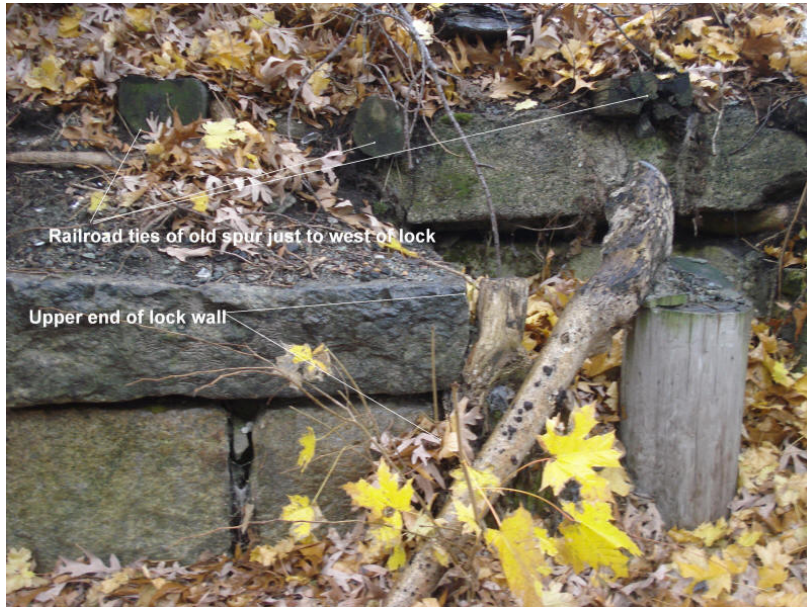
Blackstone Canal Upstream end of wall of Lock 5 12/4/12