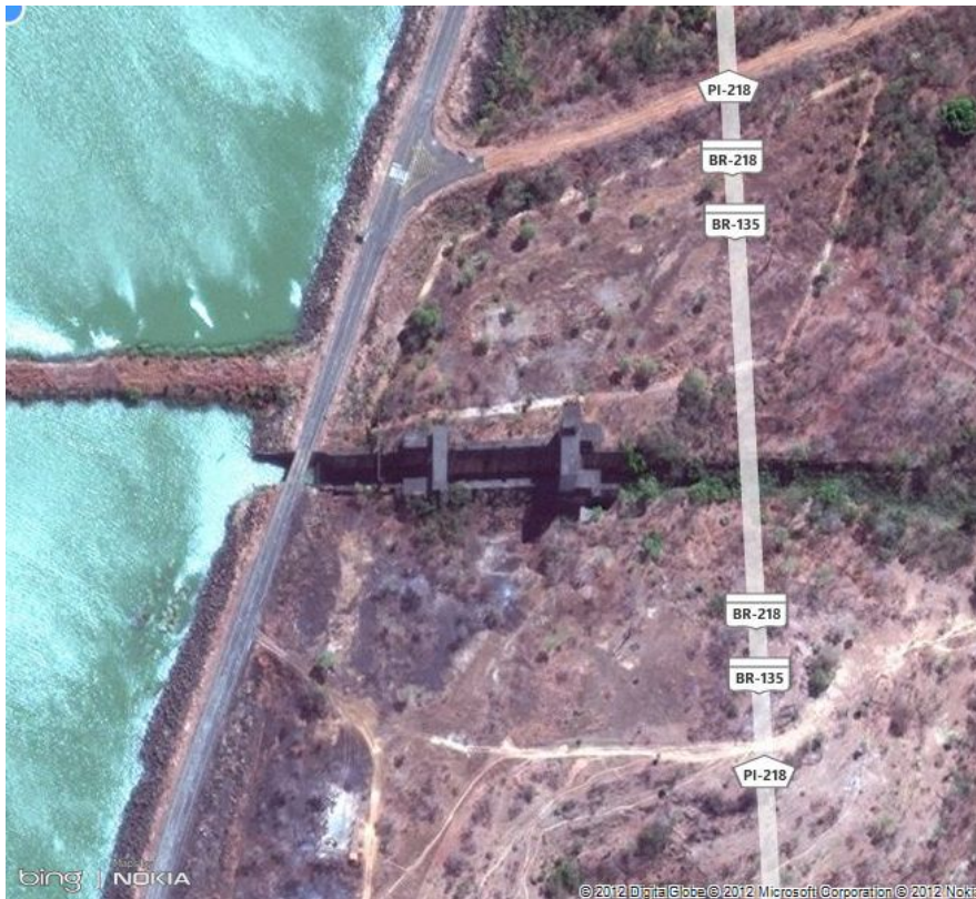
Upper lock at Boa Esperanca (Bing maps)