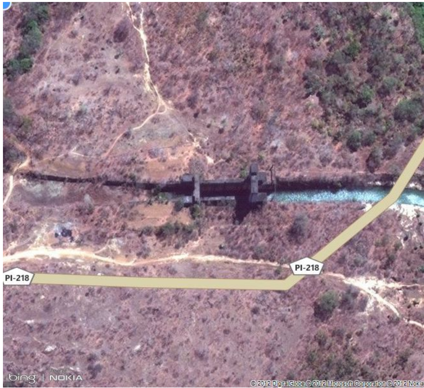
Lower lock at Boa Esperanca