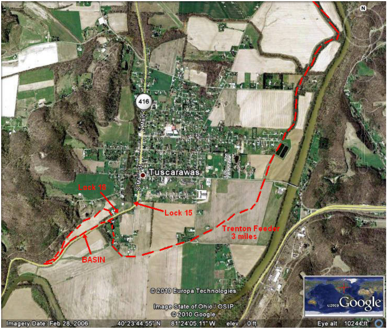
Lower end of Trenton Feeder